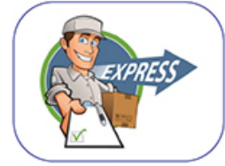
COURIER AND EXPRESS SERVICES