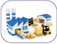
WAREHOUSING – STORAGE AND PACKAGING