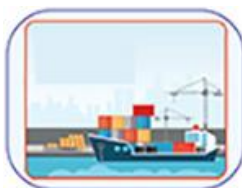
PORT TERMINALS, ICDs' AND CFS OPERATIONS