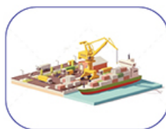
INLAND WATERWAYS AND MARINE SERVICES