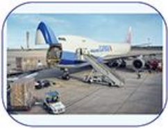
AIR CARGO OPERATIONS